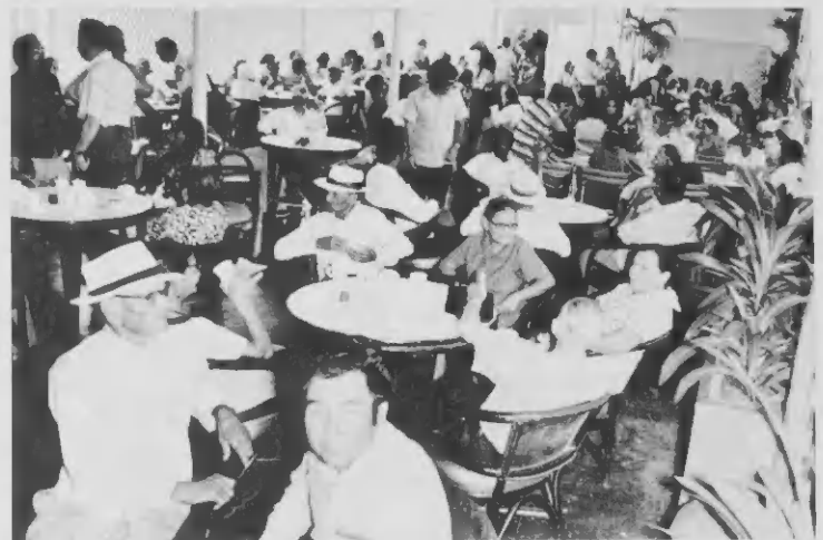
The visitors, who enjoy this yearly event, take a rest here at the Esso Club where they are treated to refreshments and coffee. E bishitantenan, kende a goza di e evento anual aki, ta sosega un rato aki na Club caminda nan ta haya refresco y koffie.